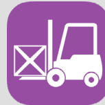
Workplace Transport Courses