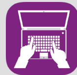
Display Screen Equipment Courses