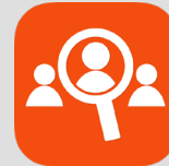
Managing Contractors Courses