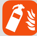
Fire Safety Courses