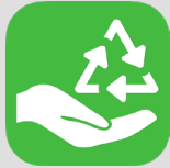
Environmental Protection Courses