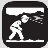
Confined Space Working