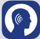
Noise at Work Courses