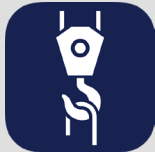
Lifting Operations (LOLER) Courses