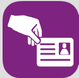
Permit to Work Courses