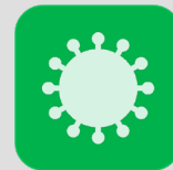
Coronavirus Prevention Courses