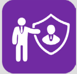
Security & Emergency Response Training