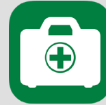
First Aid Courses