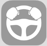
Driving for Work Courses