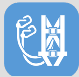
Harness & Lanyard Inspection Course