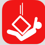
Accident Investigation Courses