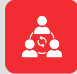
HR Compliance Courses