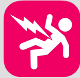
Electrical Safety Courses