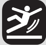
Slips, Trips & Falls Courses