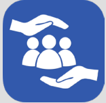
General Health & Safety