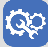
Work Equipment Courses