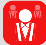
Lone Working Courses