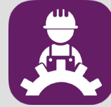
Behavioural Safety Courses