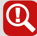
Risk Assessment Courses