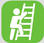
Working at Height Courses