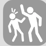
Violence & Aggression Courses