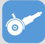
Abrasive Wheels Courses