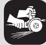
Hot Works Courses