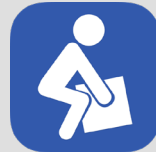
Manual Handling Courses